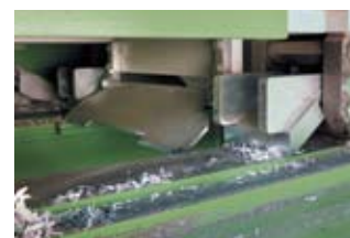
Separate roller track stripper