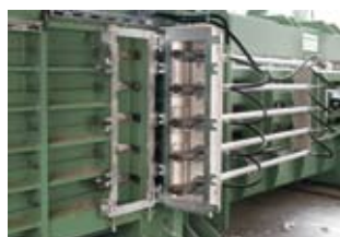
Folding, easily accessible lateral twisting unit