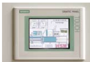
Modern control programme with touch screen