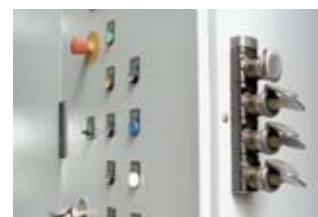
Modular keylock system for highest operator safety